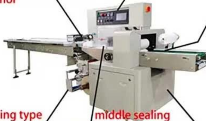
under film loading type