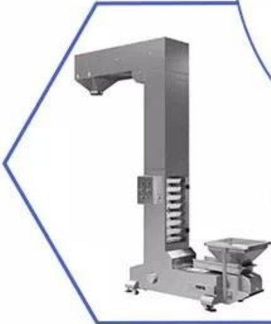
Z Type Feeding Machine