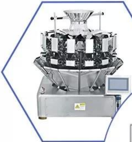
10 Head Electronic Scale