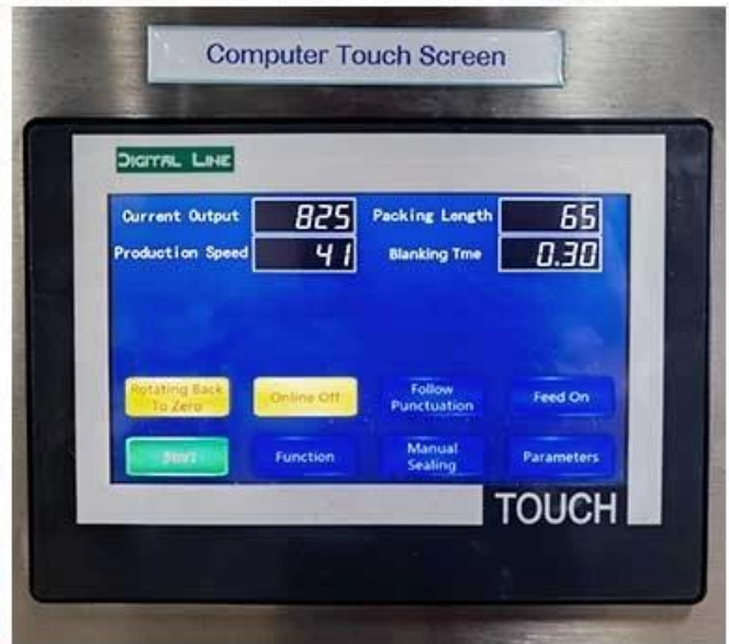
Simple operation of Chinese and English settings