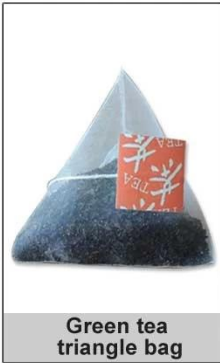
Green tea triangle bag