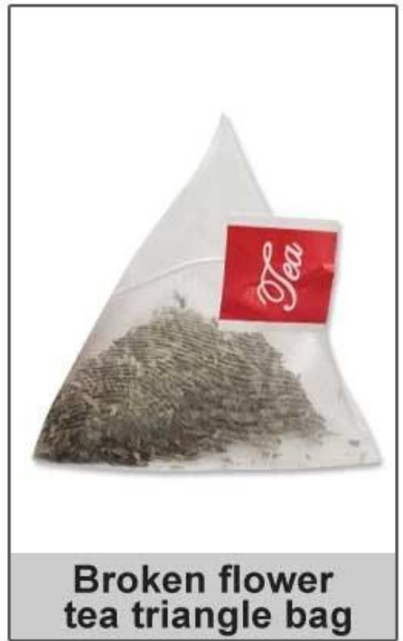
Broken flower tea triangle bag