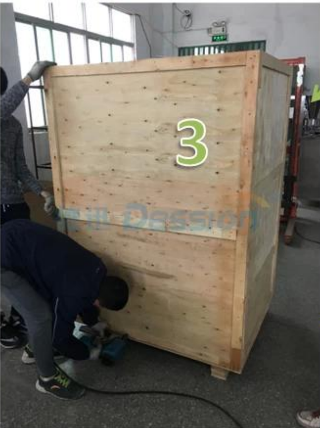
3. Sealing the carton