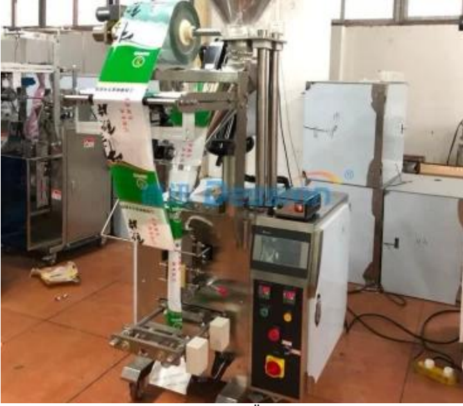
DS-320C'nin Önden Görünümü